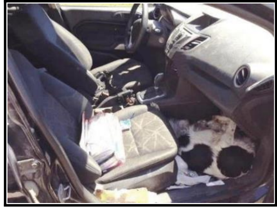
Figure 3. Interior front row, 2011 Ford Fiesta

The mother began looking and found the child in the vehicle where he and both dogs were unresponsive at approximately 1245 hours ( Figure 3 ). The child was found lying on the console between the front row seats with his head on the center instrument panel and his feet in the second row.