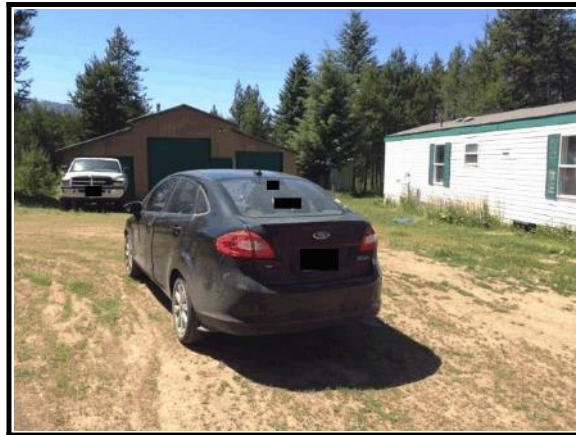
Figure 2. Incident site looking west with subject vehicle in center and residence on right

The incident occurred in the driveway of a private residence located near an unpaved county road in a rural area in Idaho ( Figure 2 ). The driveway was unpaved, hard-packed ground and scattered grass with a mostly level profile. It was generally oval in shape originating and ending at the roadway that fronted the south edge of the residential property. The Ford was parked in close proximity and south of the residence. The child had a clear path from the residence to the vehicle. The vehicle was visible from a doorway and three windows on the south side of the residence. Mature trees were present on the property and particularly within the area of the driveway but a high midday sun precluded shading directly on the vehicle. During the time the child was inside the vehicle, the sun was high above the horizon and passed directly overhead. 1 A detached garage was located on the property and west of the residence. Another vehicle identified only as a white, full-size pickup was parked facing east on the east side of the garage.