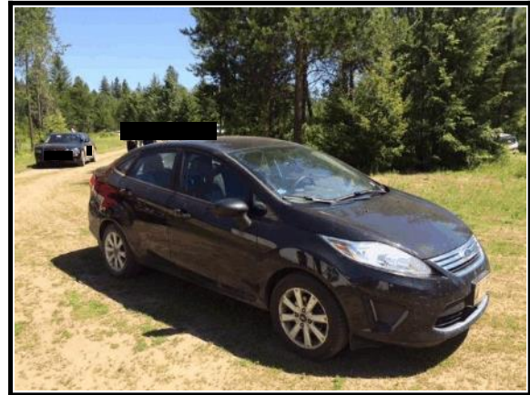
Figure 1. 2011 Ford Fiesta, looking southwest

The interest of this Remote Non-Traffic Surveillance Hyperthermia Investigation is the heat-related death of an unattended 3-year-old child who died while occupying a 2011 Ford Fiesta ( Figure 1 ). The incident was identified during a review of a web page that tracks hyperthermia-related child fatalities. The web page includes incidents where children enter vehicle and remain inside the vehicles because they cannot self-extricate. The web page does not include incidents where a child is forgotten and left alone in a child safety seat in a vehicle by a parent or caregiver. The Special Crash Investigations (SCI) team obtained the police report and images for the case and it was initiated by the SCI group of the National Highway Traffic Safety Administration on November 21, 2016.