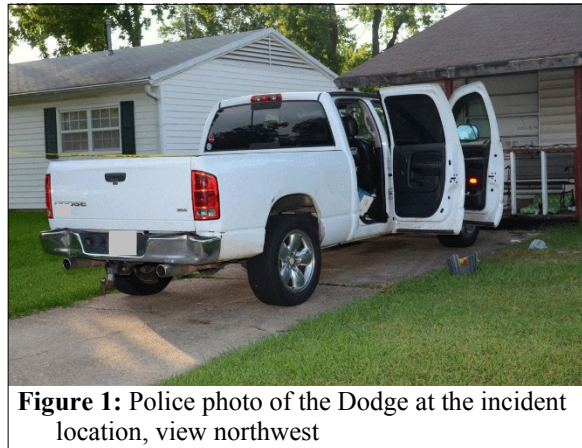
Figure 1: Police photo of the Dodge at the incident location, view northwest

The interest of this investigation is the heat stroke deaths of a 3-year-old female and a 3-year-old male in a parked, unoccupied, 2004 Dodge Ram 1500 ( Figure 1 ). This incident investigation was initiated by the National Highway Traffic Safety Administration on September 28, 2016. The qualifying criteria for a hyperthermia case of interest is that the child was not in a child restraint system (CRS) and that the child either entered an unattended vehicle or was left in an unattended vehicle and succumbed to heat stroke. This investigation was assigned on December 6, 2016, following preliminary investigation by the Special Crash Investigation (SCI) Team at the Indiana University Transportation Research Center in