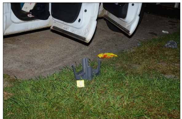
Figure 3: Police photo showing small plastic stool found on right side of Dodge

The mother stated that she awoke after being asleep for perhaps two hours and the two children were not in the residence and the front door was open. She went next door to inquire if the children may be there, then proceeded to search outside the residence with the assistance of a neighbor. The mother told police that she noticed a small stool next to the passenger side of the Dodge ( Figure 3 ). She stated she went to the vehicle and saw the female child laying on the driver’s seat. She stated that she then went to the driver’s door and found it locked with the vehicle’s key partially in the door lock. She stated she pushed the remote on the key to unlock the door and then took the child out of the vehicle. The neighbor then observed the male child in the second row between the two CRSs. His position was described as hanging off the edge of the seat with one of his feet stuck between the