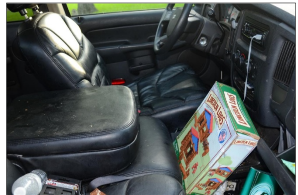
Figure 4: Box of Lincoln Logs in front row of Dodge