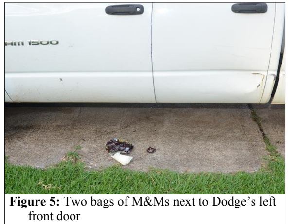
Figure 5: Two bags of M&Ms next to Dodge's left front door