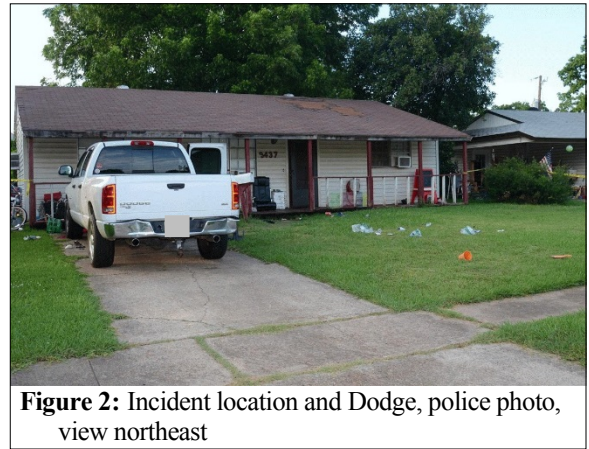
Figure 2: Incident location and Dodge, police photo, view northeast

The Dodge was parked facing northwest in the driveway of the residence immediately in front of the front porch and near the front door. The windows were closed and the doors reportedly locked. Two CRSs were secured in the second row in the left and right seating positions and a booster seat was located between them. The front row right seat position, floor, and second row floor of the vehicle were cluttered with an assortment of trash and items. The vehicle was equipped with second row child safety door locks and the lock on the left rear door was engaged according to the police incident report. The Incident Diagram is included at the end of this report on page 5. The Not-In-Traffic Surveillance data forms are attached to the end of this report as Appendix A.