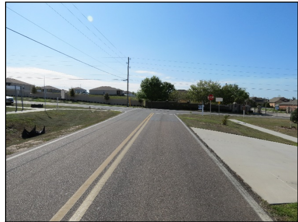
Figure 2. West-facing view of the Honda's pre-crash travel trajectory.

The Honda was traveling westbound on a two-lane local roadway at the time of the crash ( Figure 2 ). It consisted of a 2.9 m (9.5 ft) wide travel lane in each direction, separated by a double-solid yellow centerline with single solid-white fog lines. The roadway had no shoulders, and was bordered by grassy roadsides with surrounding residential properties. This local roadway intersected a north/south local roadway in a T-configuration. The intersected roadway contained a 3.2 m (10.5 ft) wide travel lane for each travel direction, also separated by a double-solid yellow centerline and with single-solid edge lines. For the Honda's pre-crash travel trajectory, the roadway was straight and essentially level.