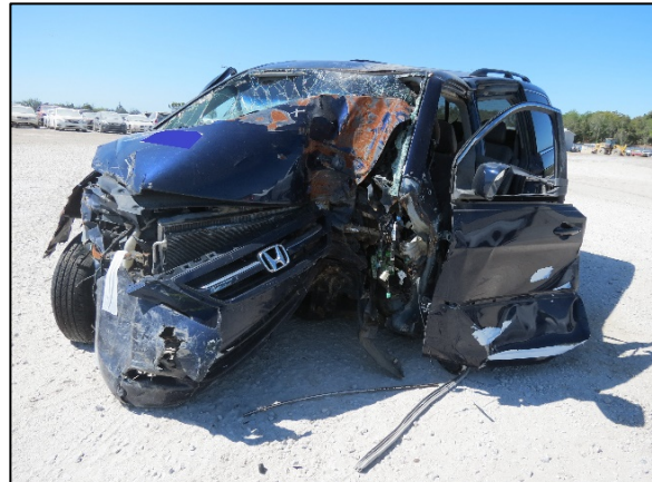
Figure 1. Front left oblique view of the Honda at the time of the SCI vehicle inspection.

This report documents the on-site investigation of a crash involving a 2006 Honda Odyssey minivan ( Figure 1 ) and the non-deployment of its air bag systems. The Honda was involved in a severe front plane crash with a large-diameter hardwood tree and a concrete block wall when it crossed through a T-configuration intersection at high speed and departed the roadway. An unbelted 32-year-old female driver sustained fatal injuries as a result of the crash. The Honda was equipped with front seat belt retractor pretensioners, a Certified Advanced 208-Compliant (CAC) frontal air bag system, roof side-rail-mounted side impact (only) inflatable curtain (IC) air bags, and front seat-mounted side impact air bags. The pretensioners did not actuate and none of the air bag systems in the vehicle deployed as a result of the crash.