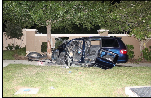
Figure 4. West-facing view toward the impacted wall and tree with the Honda at final rest.

force. As the Honda engaged the tree, severe deformation to the front plane was produced and a counterclockwise rotation about the vehicle's vertical axis was induced. As the Honda continued to engage the tree, the right aspect of its front plane struck the concrete block wall surrounding the subdivision (Event 2). Associated forces fractured an approximate 2.4 m (8.0 ft) section of the wall ( Figure 4 ). Based on the trajectory of the Honda, location of the impact, and rotation of the vehicle, the associated direction of force for the wall impact was in the 1 o'clock sector for the Honda. The Honda completed approximately 80-degrees of counterclockwise rotation and rebounded from the tree toward the north. It came to final rest adjacent to the concrete block wall, facing south.