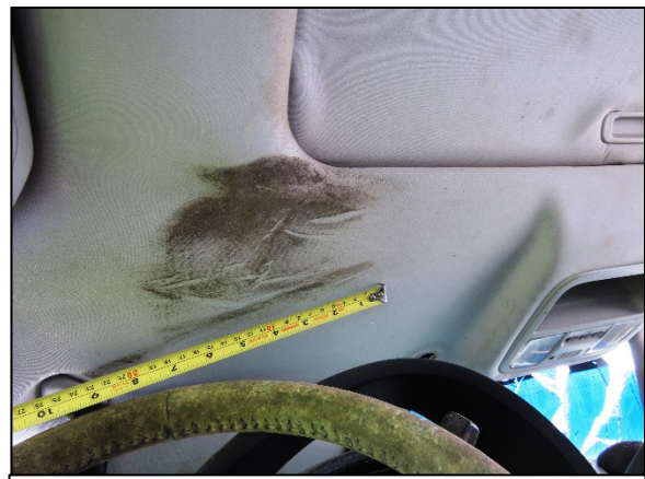
Figure 9. Area above the driver's seat position in the Honda, possibly from contact by the driver's head.