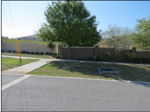
Figure 3. West-facing view toward the roadside west of the intersection and the impacted tree.

The swale contained an 8 cm (3.1 in) raised water main utility fixture and a concrete-box sewer drain. The fixture was located 3.7 m (12.2 ft) from the edge of the roadway. A 1.5 m (4.9 ft) wide concrete sidewalk paralleled the north/south roadway centered 7.9 m (25.9 ft) west of the pavement edge and a large diameter tree was located 9.2 m (30.2 ft) west of the referenced edge. Immediately beyond the tree, a concrete block barrier wall surrounded the subdivision that was located west of the intersection. The wall was located 10.3 m (33.8 ft) west of the roadway edge. Figure 3 depicts the roadside, grass swale, tree, and concrete wall. A crash diagram is included at the end of this technical report.