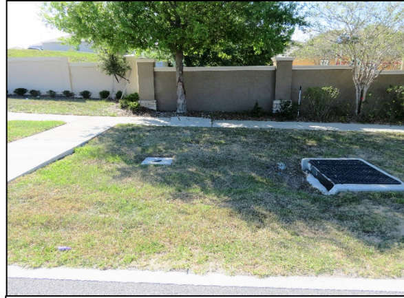
Figure 12. West-facing view of the roadside approach to the large diameter tree impact for the Honda's trajectory.

The large diameter tree was located 9.2 m (30.2 ft) from the edge of the roadway. The water main fixture/connection was located 3.7 m (12.2 ft) from the edge of the roadway and 5.5 m (18.0 ft) from the tree. At the reconstructed 105 km/h (65 mph) speed, the Honda covered the distance from the road departure to the water main in approximately 130 milliseconds. The elapsed time between the Honda's left front tire contact with the water main connection and the front plane impact the tree was approximately 150 milliseconds.