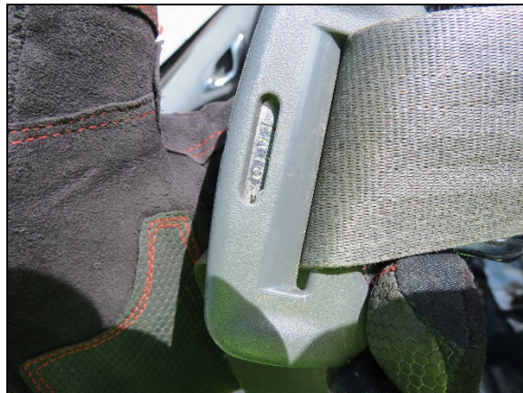
Figure 10. Latch plate of the Honda driver's seat belt system with minor loading abrasion evidence.

The Honda was equipped with front seat belt pretensioners and multiple inflatable supplemental restraints. These included a CAC frontal air bag system that consisted of frontal air bags for the driver and front right passenger positions, with seat belt buckle switch sensors, seat track position sensors, and a front right occupant presence (weight) sensor. The Honda was further equipped with front seat-mounted side impact air bags mounted in the outboard aspect of the front seat backs, as well as side impact IC air bags along each roof side rail. None of the supplemental restraint systems actuated or deployed in the incident crash.