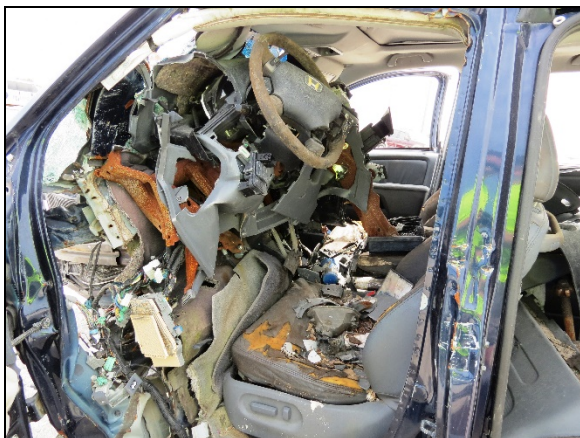
Figure 8. Crossing view of the Honda's driver position and surrounding intrusion from the left.

The interior of the Honda was inspected for crash-related damage, including intrusion and occupant contact. Due to the approximate 7-month passage of time between the date of the crash and the SCI inspection, substantial degradation of the vehicle's interior masked any surface occupant contact evidence. However, extensive occupant compartment intrusion was observed. There was severe longitudinal and vertical intrusion of the left instrument panel, steering wheel, left floor/toe pan, and surrounding components. The entire occupant space in front of the driver's seat position was consumed by the intrusion, with rearward deflection of the driver's seat and engagement of the left floor/toe pan with the driver's seat cushion. The entire instrument panel was displaced rearward and vertically by the longitudinal deformation of the frontal and engine compartment components. This induced the separation of polymer surfaces, and exposed the underlying structure of the instrument panel.