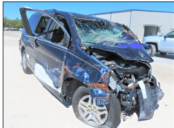
Figure 5. Front right oblique view of the Honda.

The Honda was identified by the Vehicle Identification Number 5FNRL38866Bxxxxxx. It was manufactured in Alabama in February 2006. The Honda was a 4-door minivan built on a 300 cm (118.1 in) wheelbase with a 3.5 liter, V-6, gasoline engine. Its electronic odometer reading remains unknown due to severe damage to the instrument cluster as a result of the crash. A placard declared that the Honda's gross vehicle weight rating was 2,700 kg (5,952 lb). Front and rear axle ratings were 1,305 kg (2,877 lb) and 1,450 kg (3,197 lb), respectively. The curb weight was 2,095 kg (4,619 lb). The vehicle manufacturer's recommended tire size for all