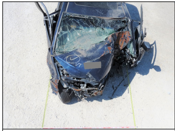
Figure 7. Deformation to the front plane of the Honda from an overhead perspective.

From a front plane perspective, the width of the direct and induced damage (Field-L) for the crush profile measured 111 cm (43.7 in). The SCI investigator obtained a crush profile along the severely deformed bumper beam, which produced the following resultant measurements: C1 = 135 cm (53.1 in), C2 = 138 cm (54.3 in), C3 = 93 cm (36.6 in), C4 = 65 cm (25.6 in), C5 = 49 cm (19.3 in), and C6 = 41 cm (16.1 in). Maximum crush was located 20 cm (7.9 in) right of the left front bumper corner at the apex of the U-shaped deformation, near the C2 measurement location.