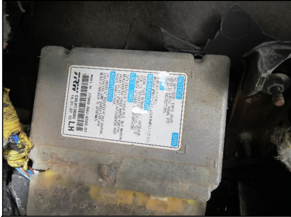
Figure 11. View of the Honda's exposed ACU beneath the center instrument stack during the SCI inspection.