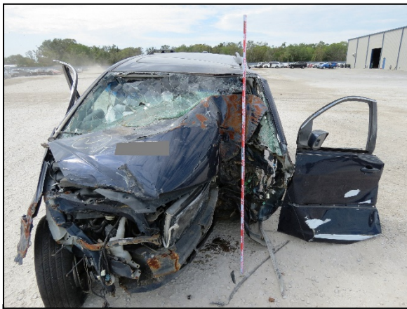
Figure 6. View of the front plane damage profile to the 2006 Honda Odyssey.

Damage to the exterior of the Honda was located on the front plane, associative to the severe frontal impact with the large-diameter tree and minor severity impact with the concrete block wall. Deformation and damage associated with the Event #1 impact was biased to the left aspect of the front plane, with severe longitudinal crush. The bumper beam, bumper fascia, hood, and surrounding components were deformed rearward in a distinct U-shaped deformation pattern, with an extent that included direct contact to the windshield header. Direct contact on the bumper beam began 35 cm (13.8 in) left of the centerline and extended to the left front bumper corner. The width of the distinct U-shaped deformation was 35 cm (13.8 in), equivalent to the diameter of the impacted tree. Figure 6 depicts a front plane view of the Honda and its severe deformation pattern, highlighted by a vertically-oriented calibrated measuring tape. Figure 7 depicts the severity of the deformation from an overhead perspective.