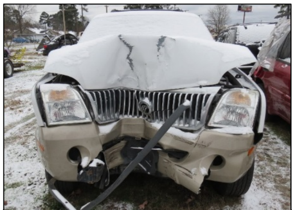
Figure 4. Damage to the front plane of the Mercury from the tree impact.