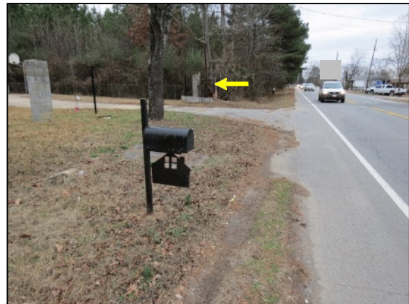
Figure 3. Approach to impact with the mailbox and tree (arrow), view northeast.