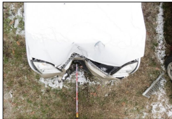
Figure 6. Crush to the front plane of the Mercury from the tree impact.

The front plane also sustained direct damage from the impact with a 39 cm (15.4 in) diameter tree. The damage involved the bumper, grille, and hood. The direct damage began 28 cm (11.0 in) right of the left bumper corner and extended 97 cm (38 in) to the right across the front plane. The Field L was 172 cm (67.7 in). Crush measurements were taken on the bumper bar and the maximum residual crush was 44 cm (17.3 in) occurring 93 cm (36.6 in) right of the left-front bumper corner. ( Figure 6 ). The crush values were: C_1 = 0 cm, C_2 = 12 cm (4.7 in), C_3 = 30 cm (11.8 in), C_4 = 44 cm (17.3 in), C_5 = 43 cm (16.9 in), and C_6 = 3 cm (1.2 in).