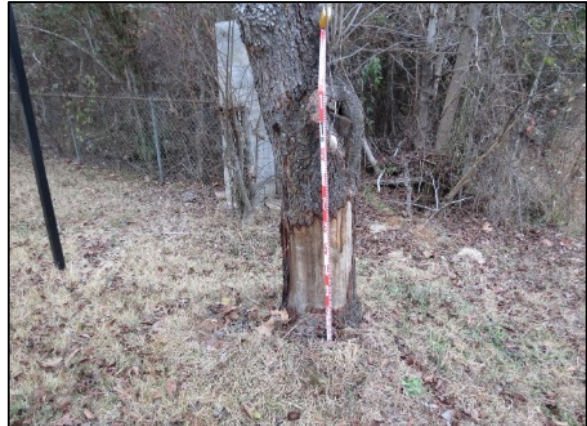
Figure 5. Tree struck by the Mercury.

The police were notified of the crash at 0738 hours and arrived on scene at 0743 hours. A witness who was traveling in front of the Mercury told the investigating police officer that she saw the crash in her rearview mirror. She stopped her vehicle and went to the crash scene. She told the police that she saw the driver exit the Mercury and throw a can in the bushes. The police found a can of “Air Duster” in the bushes with fresh blood on it. They also found the top of the can in the Mercury on the floor in the driver’s seating position. “Air Duster,” also referred to as “canned air,” is a product that is used to clean delicate computer parts and is also commonly abused as an inhalant drug. 1 It is inhaled for a mind-altering high and short-term effects can include dizziness, fatigue, muscle weakness, clumsiness, tingling in the hands and feet, hallucinations, hearing loss, and delayed reflexes. 2