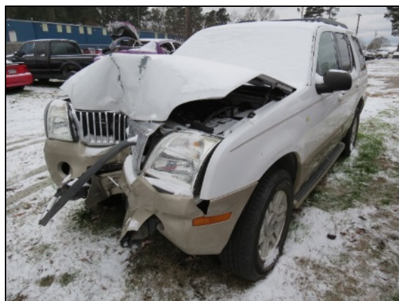
Figure 1. The damaged 2005 Mercury Mountaineer.

This report documents the driver's frontal air bag system in a 2005 Mercury Mountaineer ( Figure 1 ) and the sources of the driver's facial injuries. It was alleged by a family member that the driver's frontal air bag cover "flew totally off" during this single-vehicle crash and contacted the driver's face causing serious facial injuries including the loss of sight in his right eye. This crash investigation was initiated by the National Highway Traffic Safety Administration and assigned to the Special Crash Investigation (SCI) team at the Indiana University Transportation Research Center in December 2016. This crash occurred in Arkansas in August 2016 in the morning and was investigated by local police. The crash scene and Mercury were inspected in January 2017. An in-person interview was conducted with the driver's wife in January 2017.