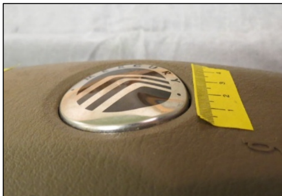
Figure 7. Dent in Mercury emblem located on top cover flap of driver's frontal air bag module.

The interior of the Mercury sustained no occupant compartment intrusions as a result of the crash events. Evidence of occupant contact consisted of a fractured transmission lever, probably from contact by the driver's right hand. The Mercury emblem located at the center of the top cover flap of the air bag module was dented ( Figure 7 ), probably by contact with the driver's face. There also was a scuff on the cover flap to the left of the Mercury emblem, also probably from contact by the driver's face. Blood spatter and transfers were present on the bottom and left portions of the deflated driver's frontal air bag. There was no deformation to the steering wheel. All the doors and the back hatch remained closed and operational. The windshield was cracked from impact forces. The remaining glazing was undamaged.