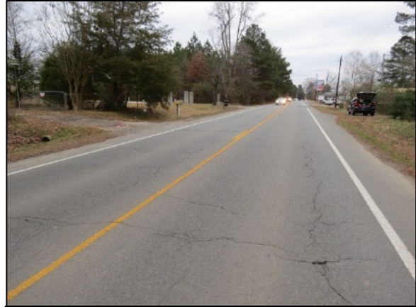
Figure 2. Northeast-bound approach of the Mercury.

The front plane of the Mercury struck the mailbox (Event 1) and displaced it from the ground. The vehicle then traveled 16.2 m (53.1 ft) through the yard and driveway of the residence and the front plane of the vehicle ( Figure 4 ) struck a 39 cm (15.4 in) diameter tree ( Figure 5 , Event 2). The impact resulted in deployment of both frontal air bags. The vehicle came to final rest against the tree heading northeast. The force direction was in in the 12 o'clock sector and the damage and trajectory algorithm of the WinSMASH program calculated the impact speed as 44 km/h (27 mph). The total calculated