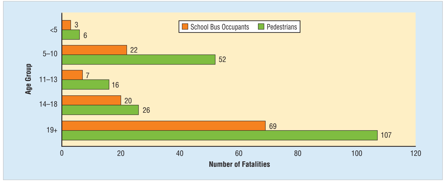
Figure 2 School Bus Occupant and Pedestrian Fatalities (All Ages) in School-Transportation-Related Crashes, by Age Group, 2009–2018