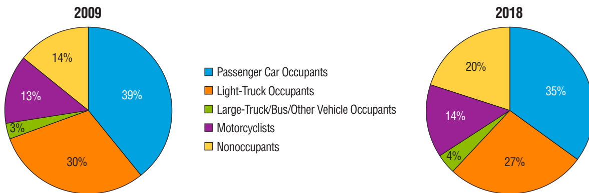
Figure 2 Percentage of Traffic Fatalities, by Person Type, 2009 and 2018

13 percent of total fatalities in 2009, up to 14 percent in 2018. Finally, the portion of nonoccupant (pedestrians, bicyclists, other cyclists, and other nonoccupants) fatalities increased from 14 percent to 20 percent over the 10-year period. The nonoccupant fatalities are the largest percentage of increase from 2009 to 2018.