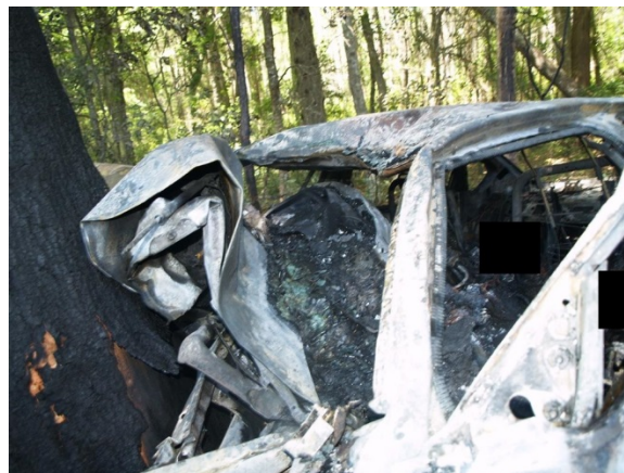
Figure 9. Distant image of the interior of the Chevrolet.

The interior of the Chevrolet was reduced in size by intrusion of frontal components. The specific and extent of intrusions could not be determined from the police images. The entire occupant compartment was completely consumed by the fire (Figure 9).