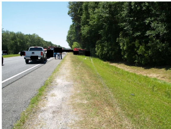
Figure 3. Westbound view of the Chevrolet's roadside departure.