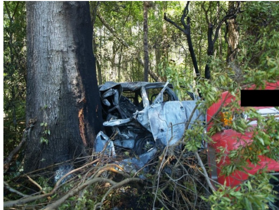
Figure 7. Northeasterly view of the final rest position of the Chevrolet.

The Chevrolet rebounded slightly and came to final rest close to the large-diameter tree (Figure 7). Passersby saw the crash site, stopped, and called the emergency response system. Several approached the vehicle to offer assistance; one retrieved a tire iron and disintegrated the left-rear door window to unlock the door to gain access to the passenger compartment. Another used a knife to cut the seat belt webbing of the second-row left and center child passengers. All three child passengers were removed from the vehicle and carried to a safe distance from the Chevrolet. The second-row left male child was administered cardiopulmonary resuscitation; however, it was determined that he was deceased.