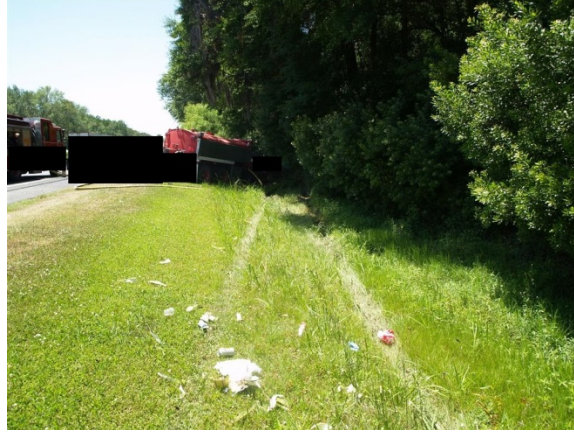
Figure 4. Westerly view of the off-road trajectory of the Chevrolet on the grass roadside.