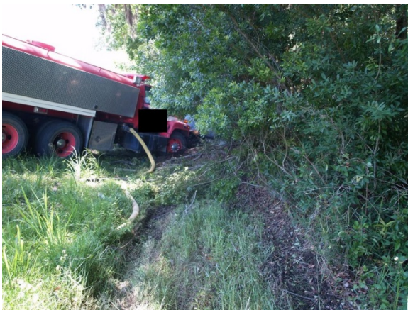
Figure 5. Westerly view of the Event 1 impact with small diameter trees.

The front plane of the Chevrolet initially contacted several trees of small diameter (Event 1) as it continued forward (Figures 5 and 6). The frontal plane then struck a large-diameter tree (Event 2) that resulted in a force direction of 12 o'clock. The impact produced severe frontal crush that appeared to have involved the windshield header of the vehicle, indicating crush extending to a collision deformation classification (CDC) zone of 6. The Chevrolet rotated counterclockwise and rebounded slightly as the back plane, left aspect contacted a small-diameter tree as it came to final rest (Event 3). Due to the severity of the crash, a fire ensued that ultimately consumed the entire vehicle (Event 4).