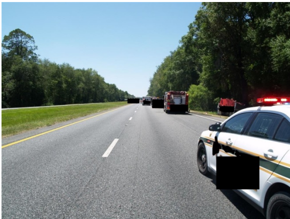
Figure 2. Westbound view of the travel lanes of the interstate roadway.

The crash occurred during the day on a divided interstate highway. At the time of the crash, the National Weather Service reported the conditions as clear with a temperature of 29 °C (85 °F), 32 percent humidity, and westerly winds of 34 km/h (21 mph). The police reported that all environmental surfaces were dry. The crash occurred on the north roadside of the westbound travel lanes. Westbound travel consisted of two lanes and an acceleration/merge lane from an on-ramp located east of the crash site (Figure 2). Based on police documentation, the left westbound travel lane was 3.6 m (11.7 ft) in width, the right lane was 3.8 m (12.6 ft) in width, and the acceleration/merge lane was 3.3 m (10.9 ft) in width. The south (left) median shoulder was 1.4 m (4.5 ft) wide while the north shoulder was 2.4 (7.9 ft) wide. All travel lanes and shoulders were surfaced with asphalt. The travel lanes were straight and level in the vicinity of the crash site. The north roadside consisted of a sand/gravel mixture adjacent to the shoulder with cut grass that sloped to a shallow drainage ditch bordered by a heavily wooded area with small and large diameter trees (Figure 3). The posted speed limit was 113 km/h (70 mph). A crash diagram is included at the end of this report.