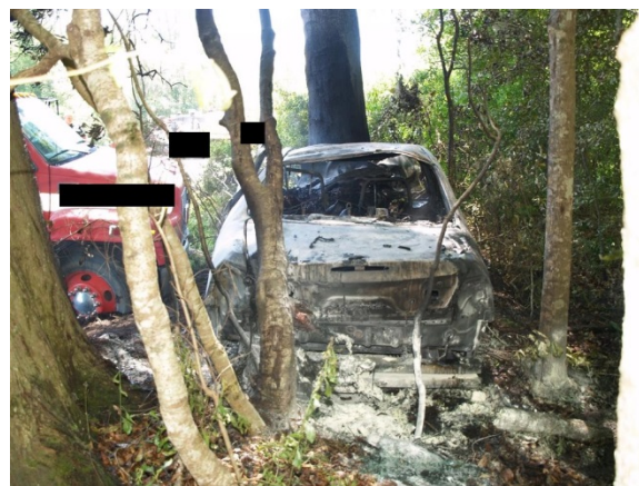
Figure 6. Westbound view of the Events 2, 3 and 4.