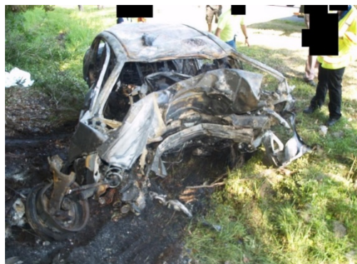
Figure 8. Frontal damage from the Event 2 impact with the large diameter tree.

The front plane then struck the large-diameter hardwood tree (Event 2). Although the impact was centered on the vehicle, the diameter of the tree spanned all three lateral zones (left, center and right). A police image depicting the width of the direct contact damage on the hood spanned 64 cm (25.2 in). The severity of the crash displaced the frontal structure beyond the base of the windshield. The hood folded and crushed rearward, resulting in windshield header deformation. The CDC for this impact was estimated at 12FDAW6 (Figure 8).